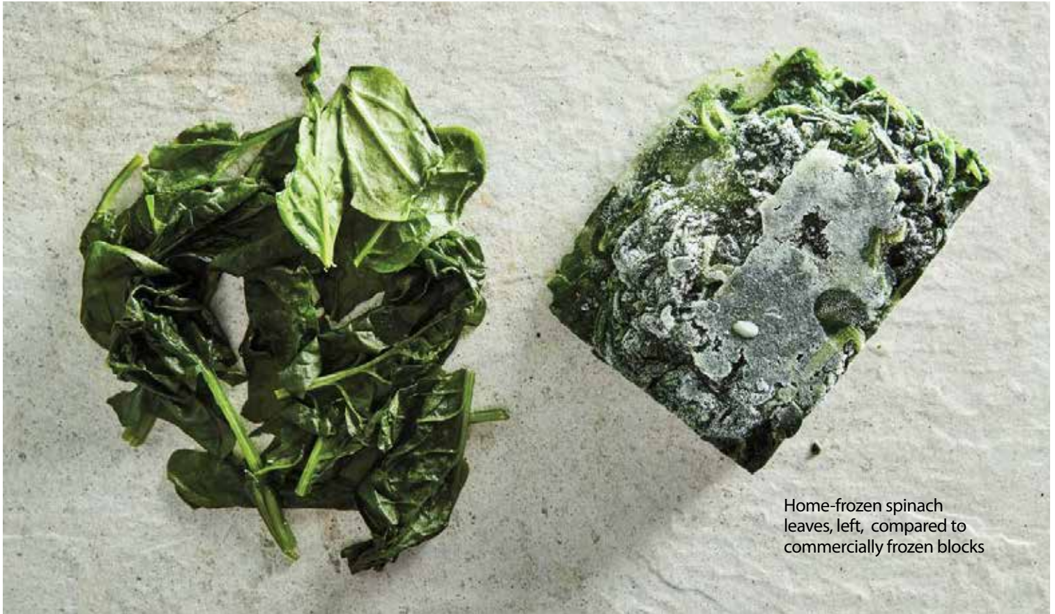
Home-frozen spinach leaves, left, compared to commercially frozen blocks

Sometimes it's not the big techniques, but the little tricks that count most in the kitchen. Here are a few we like that we learned either from experience or from other cooks.